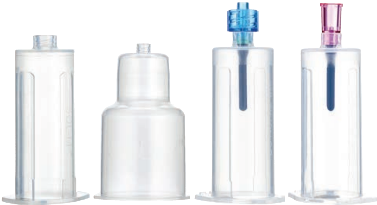
Sol-M™ Blood Collection Tube Holder

For blood specimen collection. Compatible with standard and safety multi sample needles.